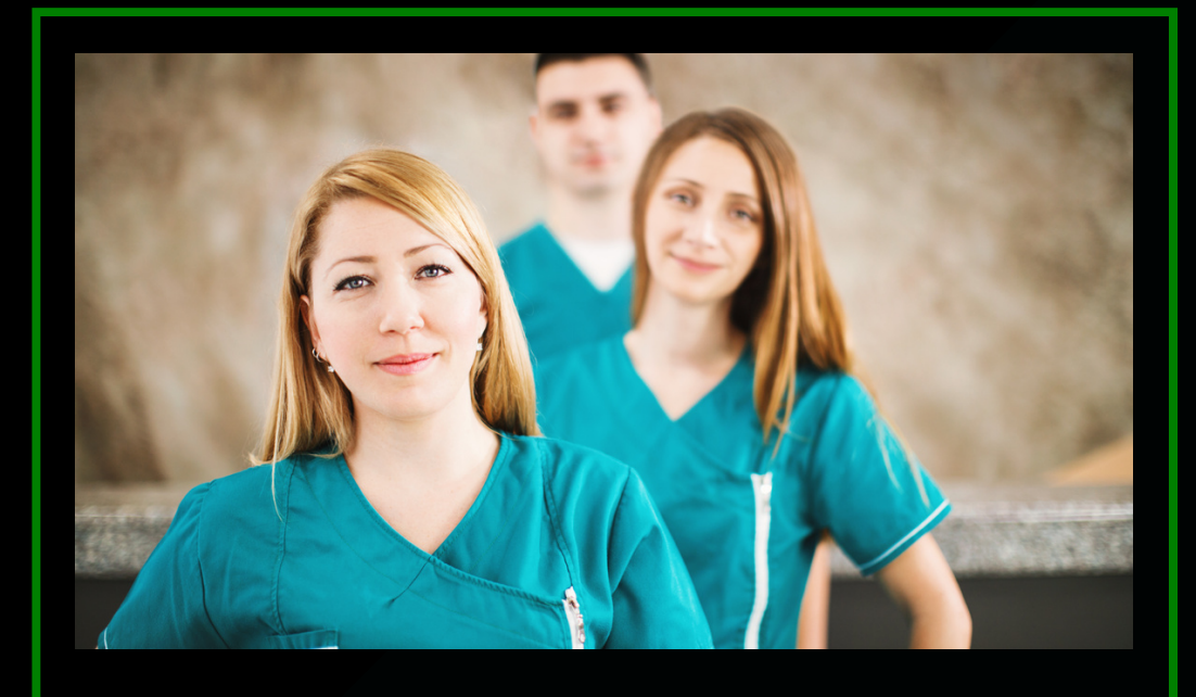
Public Health Nurses Email List

Get the #1 Verified Nursing Home Contact List for Email Marketing