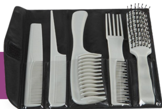
5-Pc. Styling Comb and Brush Set

Elevate your synthetic wig like the Isla Mid-Length Straight Bob Wig by Paula Young® with layers and texture. Use styling products like texturizing Wig Hair Spray and the 5-Pc. Styling Comb and Brush Set for a voluminous natural look.