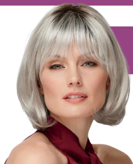
Isla Mid-Length Straight Bob Wig by Paula Young®