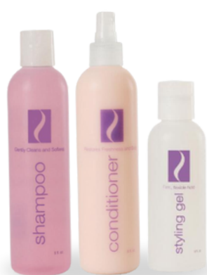
Wig Shampoo, Wig Conditioner & Wig Styling Gel